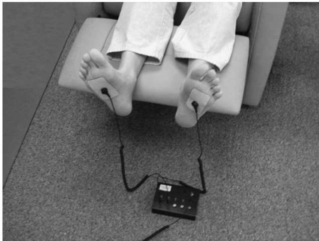
FIG. 1. Grounding system showing patches, wires, and box connecting to a ground rod planted outside through a switch (not shown) and a fuse (not shown). Similar patches and wires from the hands were also connected to the box to ground the hands.

For zeta potential calculations the Smoluchowski equation was used as follows 27 :