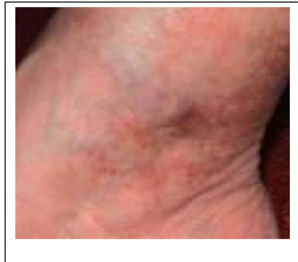
After: 7 nights using ground patch

(Subject (age 65) with chronic pain and inflammation in ankle, (photo at left), reported that significant relief from pain occurred within minutes of grounding via the patch. After grounding for 7 nights, (photo at right), inflammation disappeared and circulation significantly improved.)